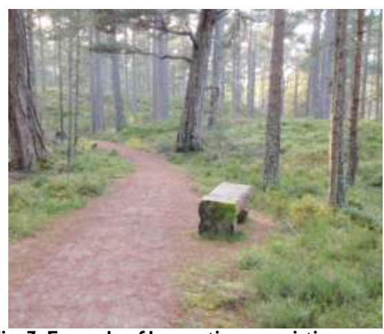
Fig. 7: Example of log seating on existing section of all abilities path