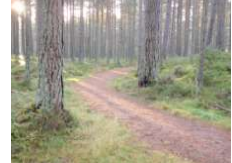
Fig. 9: a section of the existing all abilities path