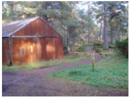
Fig. 8: Start of all abilities, adjacent to Steel Mill