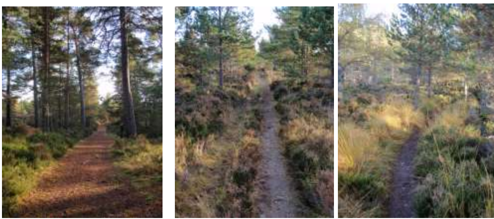
Figs. 2 - 4: Examples of varying terrain on the existing paths

١. Planning permission is sought within Dell Woods, to the south of Nethy Bridge, to upgrade an existing path, over a length of 2,100 metres, to all abilities standard. The work includes the creation of passing places, landings and the development of a new 40 metre section of new path. The existing path is part of a wider network of paths in the area and encompasses the Kings Road and Hamacks paths. The proposed upgrading works to bring the facility to all abilities standard would include resurfacing and improvement of gradients. The works would be undertaken within a 5 metre working corridor and the width of the finished path would be 1.5 metres. Dell Woods is part of the Abernethy National Nature Reserve (NNR) and the land is owned and managed by Scottish Natural Heritage (SNH). The subject site also lies within several other natural heritage designations, including Abernethy Forest Site of Special Scientific Interest (SSSI), and Abernethy Forest Special Protection Area (SPA), as well as the forest being within the Cairngorms Special Area of Conservation (SAC).