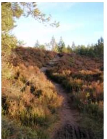
Fig. 6: Section to be by-passed